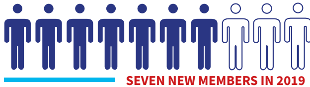
SEVEN NEW MEMBERS IN 2019

2019 concluded with a total Membership of 254 (104 contractors & 150 associates). Over the past 5 years, Membership continues to rise!